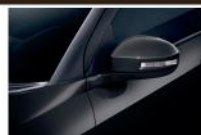
Midnight Black Pearl (ZAM)