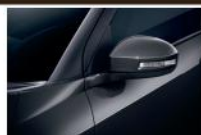
Glistening Grey Metallic (Z2Z)