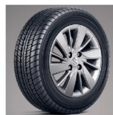
15-inch Alloy Wheels