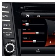
Touchscreen Audio Unit with Navigation System