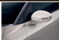
Arctic White Pearl Metallic (ZHJ)