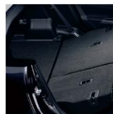
Versatile Carrying Capacity 60:40 Split-foldable Rear Seats