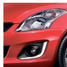
Stylish Cluster Lamps and Fog Lamp Vessel with Satin Silver Accent