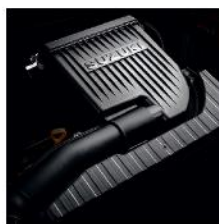
1.2 Liter, 4 Cylinder VVT Engine

The Swift's bold and stylish design forms a silhouette like none other. Its unique spirited character now stands enhanced.