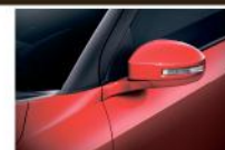
Solid Fire Red (Z4Q)