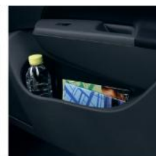
Multiple Storage Spaces