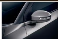
Silky Silver Metallic (Z2S)