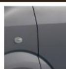
Graphite Gray Pearl Metallic (ZDL)