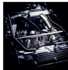
1.6 Liter, 4 Cylinder SOHC 16V Engine

APV is also best for business looking for a reliable and cost-effective vehicle that you can always depend on. So whether it's for business or pleasure, you know you can live life to the fullest and enjoy more ..... the APV way.