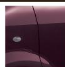
Pearl Burgundy Red (GLX/SGX) (ZLL)