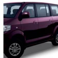
High Ground Clearance