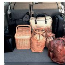
Foldable Seats for Additional Space