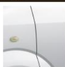
Superior White (GA) (26U)