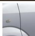
Silky Silver Metallic (Z2S)