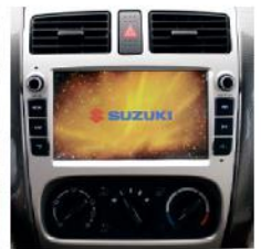
8-inch Infotainment System