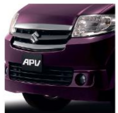
Front Fog Lamps